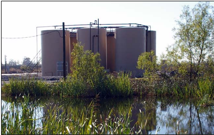
Oil Storage tanks at East Chalkley

Target has been advised by the operator that further drilling at Pine Pasture is now scheduled for the 3 rd quarter of 2010.